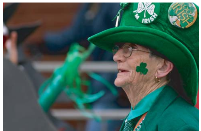
St Patrick's Day Parade, Digbeth, 2006.

To learn more about the project or to take part with your own memories, call Gudrun on 0121 373 2747 or email stpatrickshistory@word-works.org