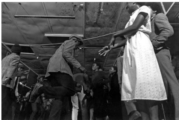
Dance, Winson Green Community Centre, 1970s. Photo: Vanley Burke [MS 2192]

The event promises to be a day of information and inspiration packed with talks, workshops and tips on where to go and what to look for when researching aspects of black history, with a practical focus on using resources available in Birmingham City Archives.