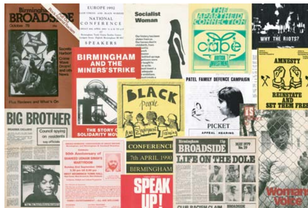
Selection of ephemera from the collections

Elements of the labour movement were mobilised during the 1984 Miners' Strike and again in the aftermath of the 1985 Handsworth disturbances. The collections reflect this, as well as a concern with women's issues and the interests of minority groups. Campaigns against the Prevention of Terrorism Act and restrictive immigration and asylum legislation are also recorded. Both collections include information from a large number of local campaigning and community organisations which illustrate these activities, as can be seen in the examples reproduced here.