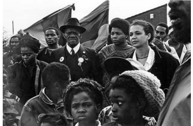
African Liberation Day, Handsworth, 1981.