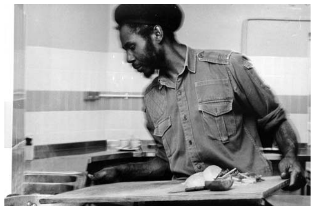
"I had many delicious meals made by this man...His Fish Tea is the best." From 'Five Years - A Life Time' [MS 2192]