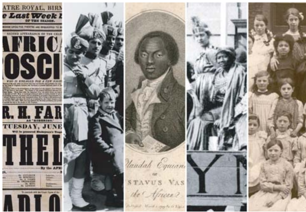
Abstracts of documents from 'Researching Black History' e-learning package