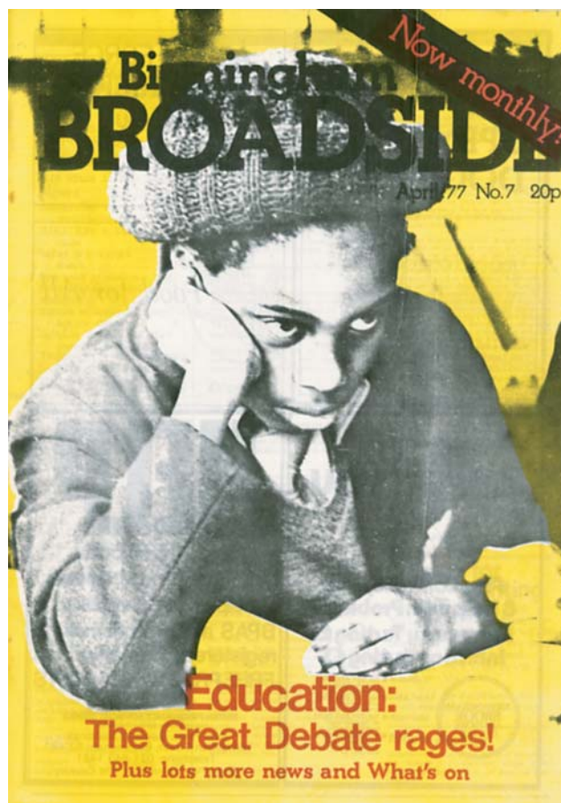
Newsletter 'Birmingham Broadside', April 1977 [MS 1591]

The collections [MS 1591 & MS 2009] are available at Birmingham City Archives on Floor 7 of Central Library [0121 303 4217]