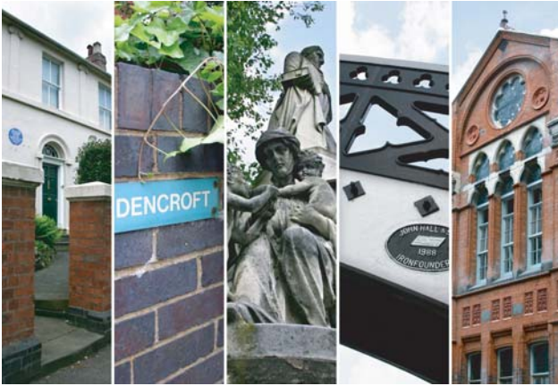
Abstracts from the Sturge city trail.