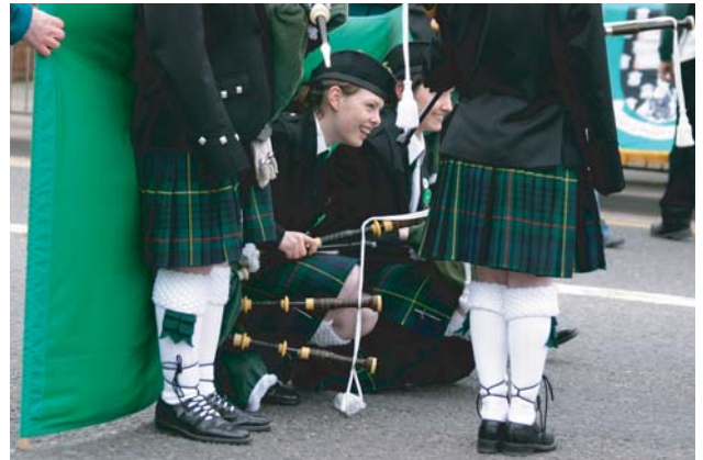
Sheltering from a bitter wind before the parade, 2006.

The St Patrick's Festival is putting together a book and exhibition about Memories of St Patrick's Day in Birmingham from as far back as we can go right up until the present day.