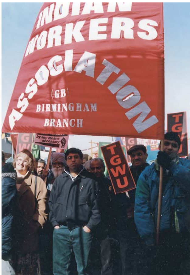
TUC demonstration against racism, London, 1994 [MS 2141/Digital Images]