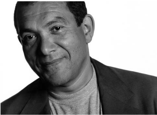
Bruce Oldfield, 2000. Photo: Robert Taylor [MS 2448]

The Exhibitions section on our website includes a number of displays of photographs and documents. Here we feature four from Photographic Exhibitions .