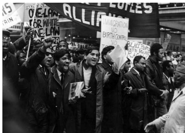
Black Peoples Alliance Protest March, 1960s.

The archive of the Indian Workers Association has formed the basis of one of Connecting Histories' online learning packages. 20th Century Campaigns in the Campaigning for Social Justice package features information about the IWA's anti-racist campaigning and their welfare and cultural activities, placing the organisation and its history in the context of other campaigns in the same period. This material can be found in the Learning section of our website.