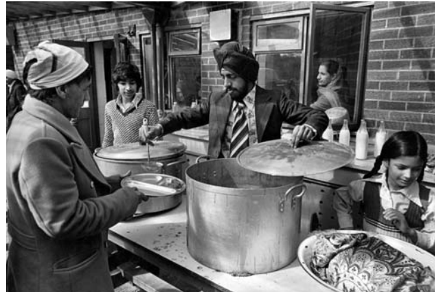
Sharing Food, 1976.