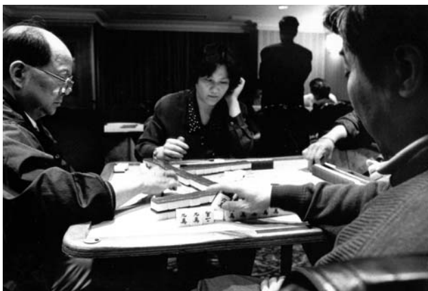
Mah Jong, 1995.