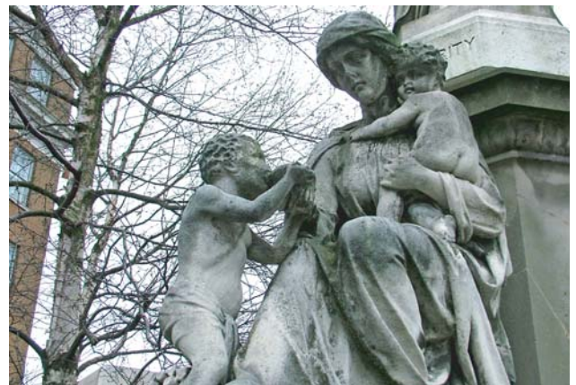
Detail from the Sturge statue at Five Ways, 2006.

Sturge, a devoted Quaker, came to Birmingham in 1822, and the trail starts at the site of his home in Wheeley's Road and ends in Victoria Square, where the Town Hall provided a prominent stage for a range of his social causes including antislavery. The statue of Sturge at Five Ways is one of the locations on route. Unveiled in 1862, it reflects his wide political and humanitarian interests. Two symbolic angel figures stand guard, one holding a laurel leaf, the other reaching towards the figure of a young slave. Neglected for many years it has recently been repaired and will be rededicated on 24 March.