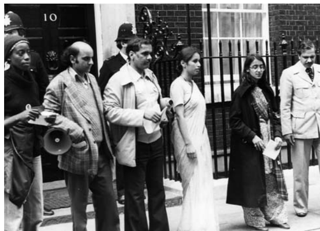
Demonstrators outside 10 Downing Street. March against state brutality, 3rd June 1979

Papers also include records of other campaigning organisations that the Indian Workers Association had links with, such as the Black Peoples Alliance, the Campaign Against Racism and Fascism (CARF), the Campaign Against Racist Laws (CARL), the Co-ordinating Committee Against Racial Discrimination, and the Association of Indian Communists.