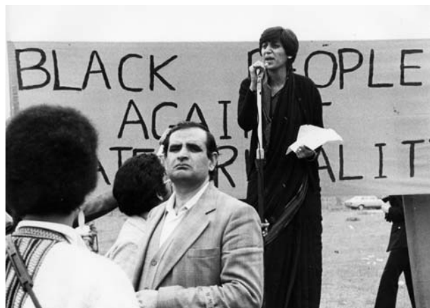
Demonstration against state brutality, 3rd June 1979 [MS 2141/Digital Images]

Major campaigns focused on discrimination and social exclusion facing Indian and other black and Asian migrants in Britain through poor housing conditions; employment inequalities; the operation of a 'colour bar' in employment and education, as well as in shops, public houses, and other leisure facilities; and the restrictions of immigration legislation introduced during the 1960s and 1970s. The Indian Workers Association supported industrial disputes involving black and Asian workers at workplaces in the Midlands and expressed solidarity with the Trade Union movement, although it also campaigned against racial discrimination within trade unions.